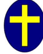
The Batt C.E. School

St Mary's CE Infant School 19 Church Green Witney Oxfordshire OX28 4AZ Telephone: 01993 702387 office@stmarysinfants.co.uk www.st-marys-witney.oxon.sch.uk The Batt CE Primary School Corn Street Witney Oxfordshire OX28 6DY Telephone: 01993 702392 office@thebattschool.org.uk www.thebattschool.org.uk