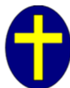
The Batt C.E. School